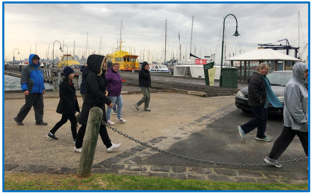
Willy Walking Group braving the cold!