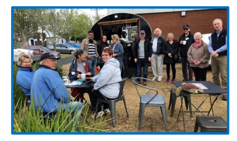
The Willy Walking Group enjoying our Pop-Up Social Cafe