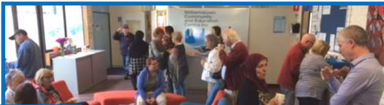
First Morning Tea for the year