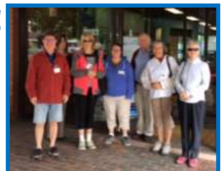
First 2018 outing for the Walking Group