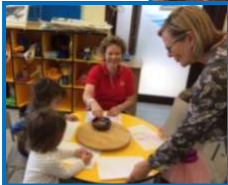
Pelicans Three Year Old Program on day two