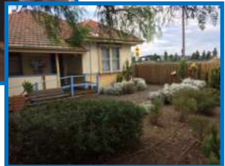
Garden tidied up at Spotswood Community House