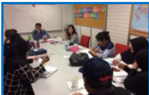
English classes starting up at Joan Kirner House