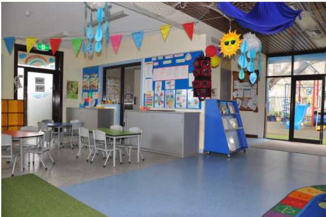
Room 5: Children's Area