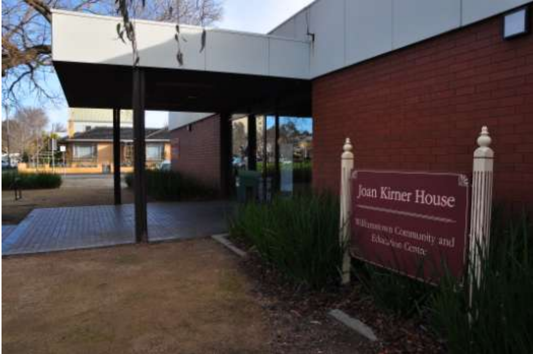
Joan Kirner House