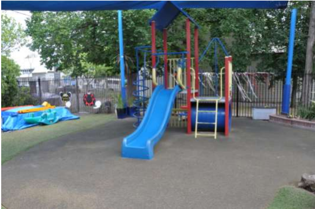
Room 5: Children's Area