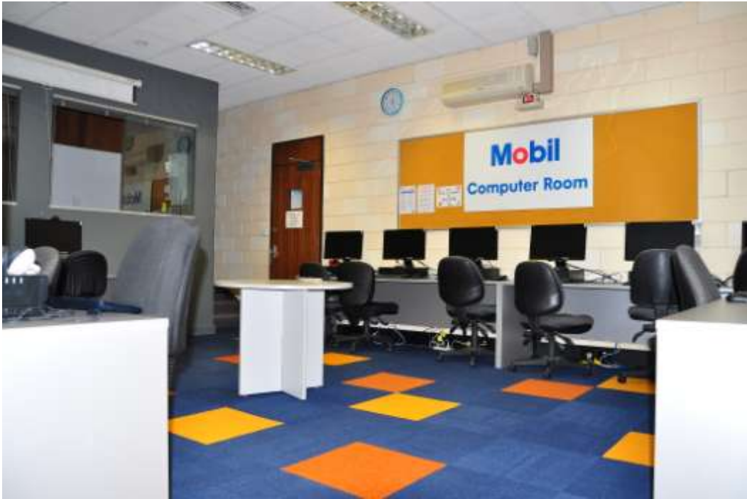
Room 2: Computer Room