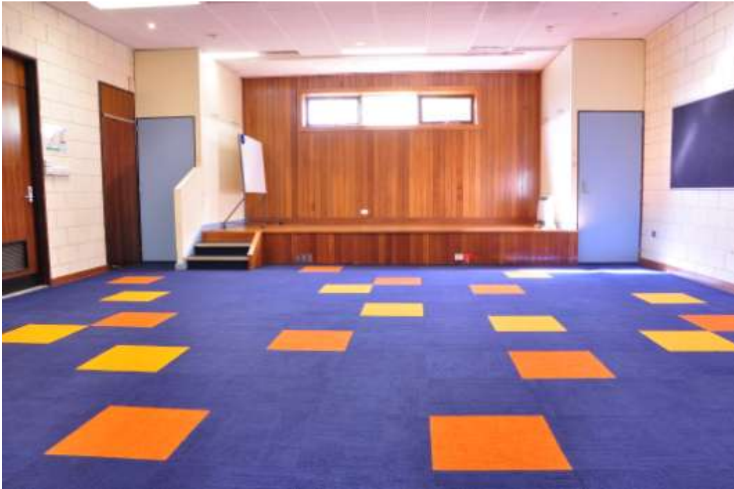
Room 1: Multi-purpose Room