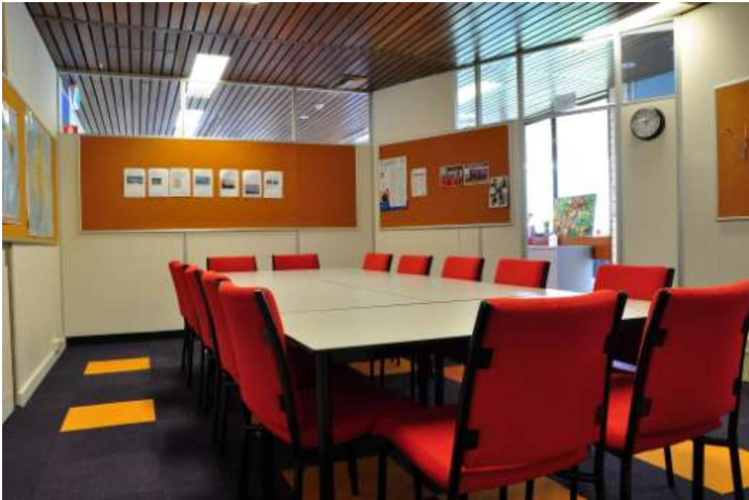
Room 4: Classroom