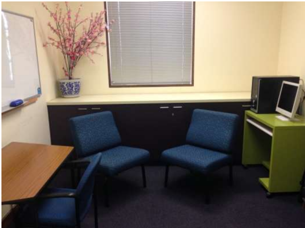
Room 9: Office/Private Room