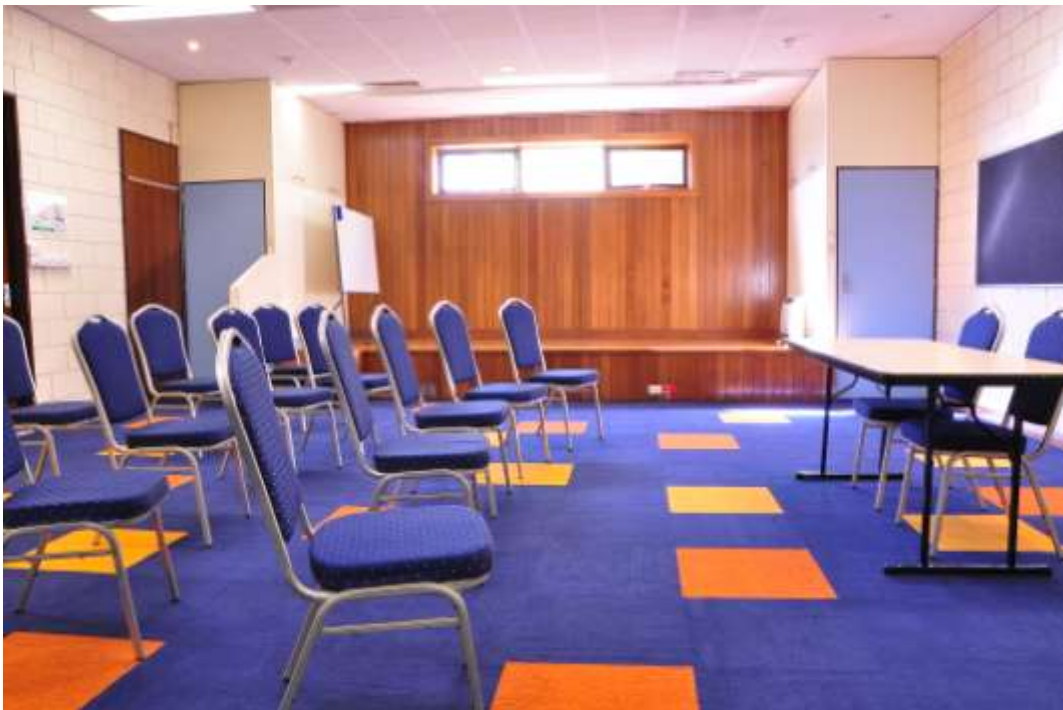
Room 1: Multi-purpose Room