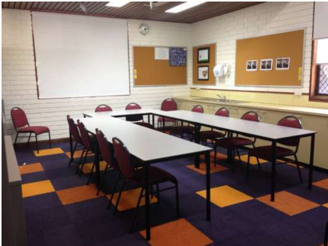
Room 3: Classroom