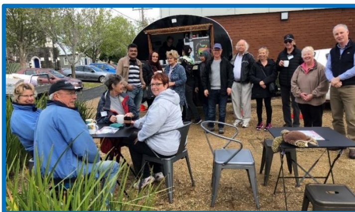
The Willy Walking Group enjoying our Pop-Up Social Cafe