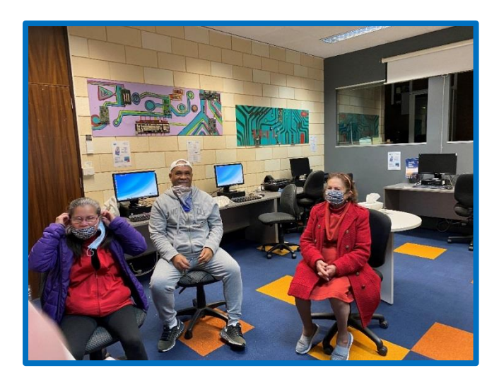
The Be Connected 'Health My Way' Sessions have recommenced.