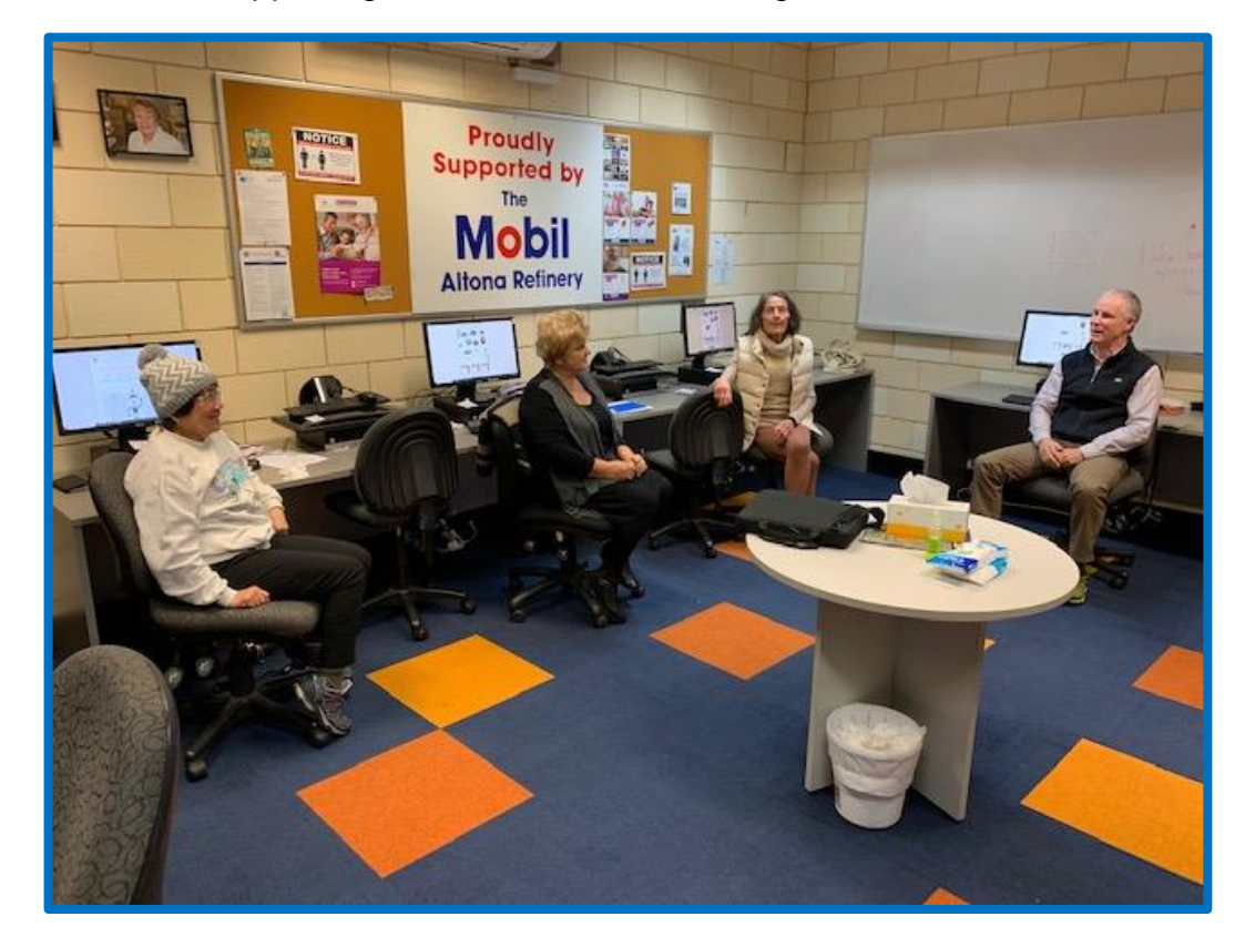
Computer classes back!

This project supports people to learn essential digital health literacy skills that are critical to ensuring every Australian has the ability to make informed, confident choices when it comes to supporting their health and wellbeing online.